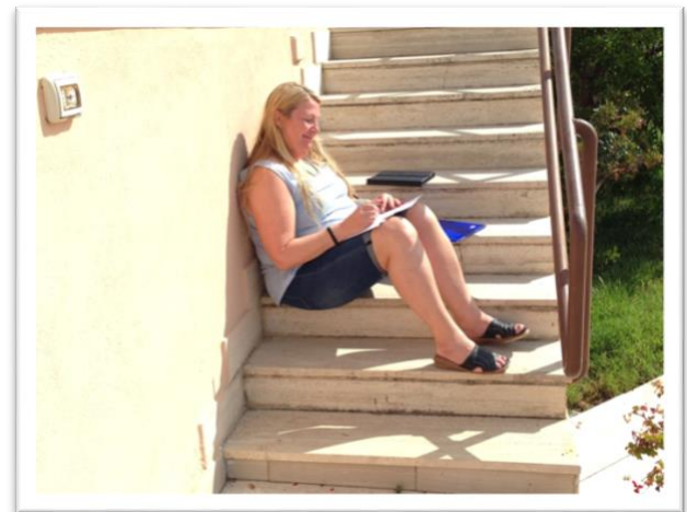
Studies inside and outside...

The course has a practical focus but you will also learn about the theoretical basis of this transformative classroom pedagogy.