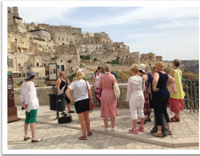
Visit in Matera, one of the oldest cities in the world.